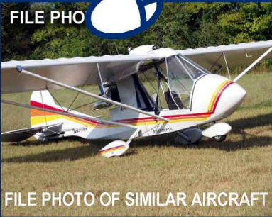
FILE PHOTO OF SIMILAR AIRCRAFT