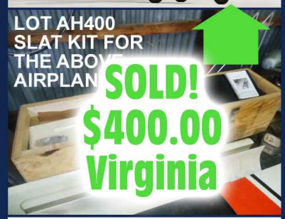
LOT AH400 SLAT KIT FOR THE ABOVE AIRPLANE