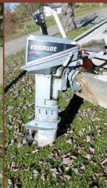
Just Added: 1980 Aluminum 15' fishing boat with trailer, 10 HP Evenrude motor, and a trolling motor.

Household Furnishings: Oak pedestal table w/6 chairs, king size bed, bedroom furniture, bookcases, standing mirror, 5 bar stools, dark oak 7 pc dinette, lounge chairs, hand stenciled child's rocker, dish and glass beautiful dining room suite, cedar chest, portable