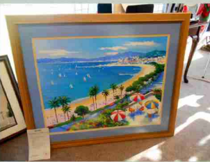
Owner Paid $1250.00